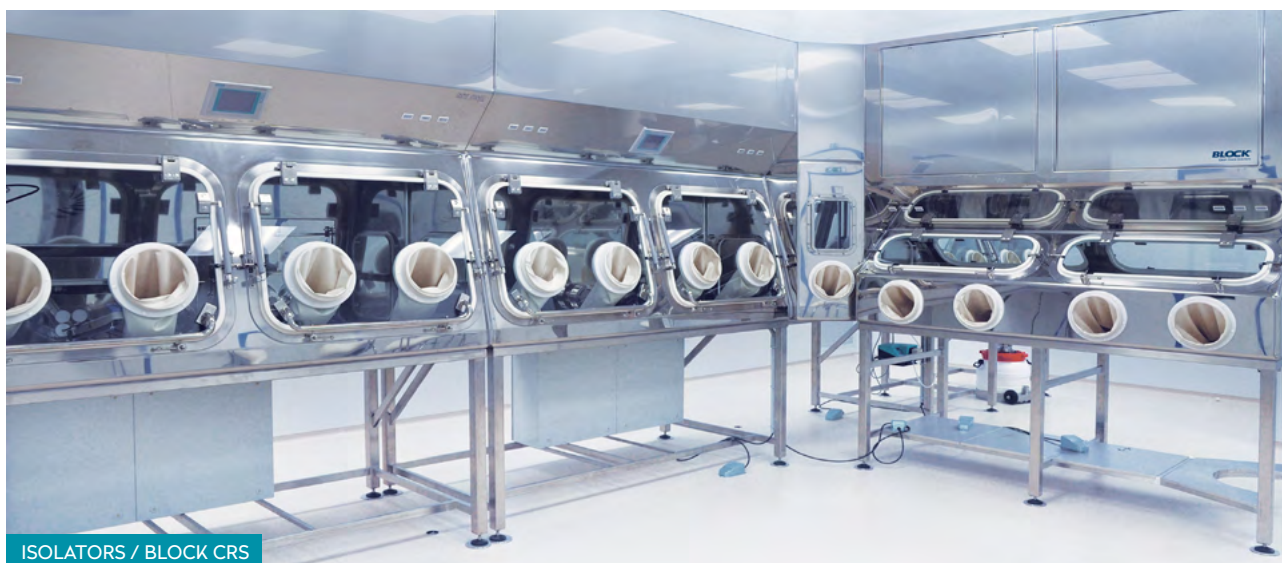
ISOLATORS / BLOCK CRS

High-tech systems for heating and drying of materials with an accurate and reliable run of individual processes, suitable for use in research, development, production, business activities, or for quality control. The sectional principle that applies to the design of laboratory ovens allows a wide range of optional equipment and accessories. The basic model is available – depending on the oven