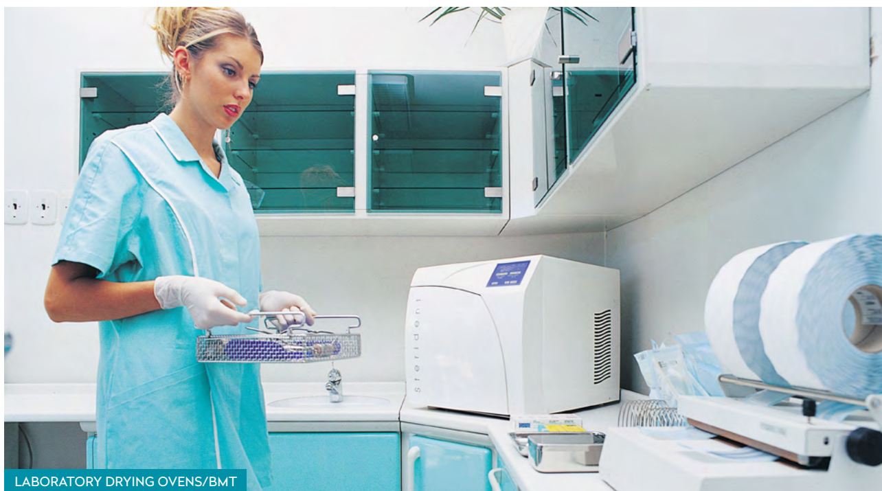
LABORATORY DRYING OVENS/BMT